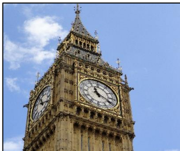
Elizabeth tower / Big Ben