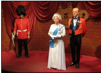
Madame Tussauds museum

The Tower of London is one of the most popular tourist attractions in the city. You can discover the thousand-year history of the Royal palace and see the world-famous Crown Jewels. Moreover, the Tower is believed to be haunted [To have ghosts] so be careful if you go on the ghost tour in the evening. The evening tour is very, very popular so book early.