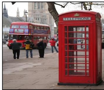
London telephone box