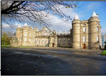
Palace of Holyroodhouse ...