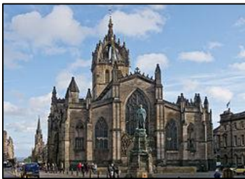
St Giles Cathedral

The Palace of Holyroodhouse and Holyrood Abbey has very often been at the centre of Scottish history as Kings and queens have been married at this beautiful Palace. You can view the historic rooms, see famous paintings of past Kings, and walk through the Breathtaking [Amazing] gardens to pass the time. It's great for the whole family to enjoy.