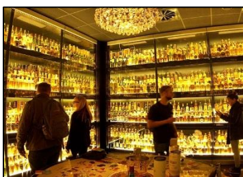
Scotch Whisky Experience

This is one of Edinburgh's three main art galleries and has paintings of some of the most famous Scottish figures [People] from the past 500 years. It even has paintings from the world renowned [World famous] painter Pablo Picasso. There are so many paintings to see that you may need two to three days to see them all. So come and unwind [Relax] while enjoying beautiful pieces of art.