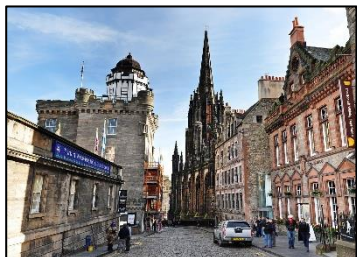
The Royal Mile

This is perfect if you want to get away from the hustle & bustle [Busy with many people] of the city and unwind [Relax]. The Scottish highlands have some of the finest scenery [Best views] in Europe, so if you love taking photos this is the place to be. Furthermore, you can try and see the famous Loch Ness Monster as you wander along [Walk along] the stunning [Amazing] lake.