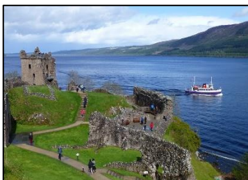
The Loch Ness tour

This is a scary underground tour where you can see how the people of Edinburgh once lived. You can stroll through the [Walk through] dark tunnels and experience what it was like living in these dark places. However, if you do decide to go down the tunnels be careful, because they are known to have ghosts walking around.