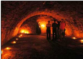
City of the dead ghost tour

When you think of Scotland you think of Edinburgh Castle. You can learn about its past, wander along [Walk along] the castle walls, view Scotland's Crown Jewels, enjoy the dungeons [Underground prison], and spend time taking in the breathtaking [Amazing] views of this historic city. This is a must see attraction for every visitor of Scotland.