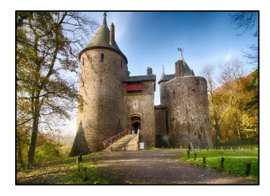
The Red Castle: Castell Coch

This is world famous for being one of the best places for performing arts [Dance, singing etc.], and is also one of the most important cultural places in Cardiff. If you love dance, ballet, opera, comedy shows and musicals, then this is a must see on your travels.