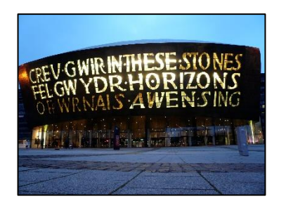
Wales Millennium centre

If you love sport then this place is for you. This is one of the country's best sports stadiums. The roof is retractable (Can open and close), and can hold many sports events such as football, Rugby and motorsports. Furthermore, there are music concerts throughout the year which attracts thousands of people to the city.