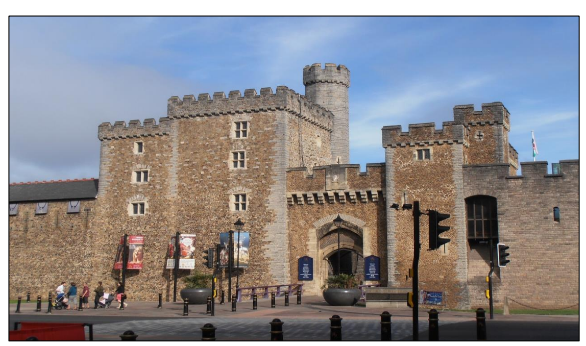
Symbol of Cardiff

See below for of the attractions that are a must see on your visit to this great city.