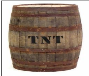
Barrel of gunpowder