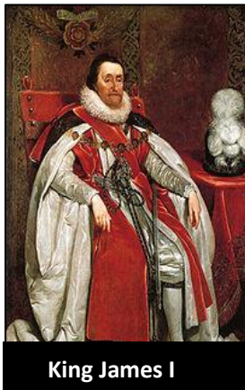
King James I