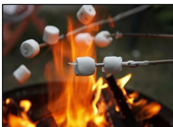
Marshmallows cooked over an open fire