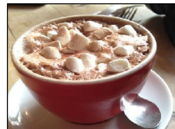
Hot chocolate with marshmallows