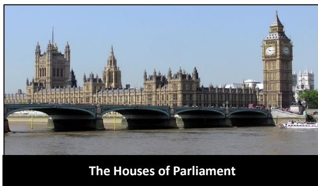
The Houses of Parliament

They hoped that King James I would change the laws , but he didn't. In fact, King James I, made more laws which were also against Catholics . This made Guy Fawkes and the other Catholics very angry, which is the reason why they came up with the ' gunpowder plot ' in 1605 to kill the king.