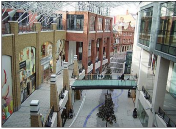
Victoria Square Shopping centre