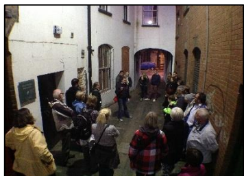
Belfast's ghost walks

Cave hill is right next to Belfast Castle. So, once you have looked around the castle, you can take a walk up the hill and enjoy the stunning [Amazing] scenery [Views] of the whole of Belfast. It's a perfect place to go hiking [to go on long walks in the countryside] and enjoy the fresh air of Belfast's countryside.