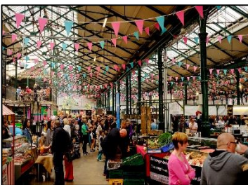
St. Georges Market

This is a perfect place if you want to look for that special gift to take home, as there are numerous (many) shops for you to enjoy. So, if you love window shopping [Look but don't buy] or splashing out [Spending a lot of money] on that perfect gift, then make sure you visit this shopping paradise [Perfect place for shopping].