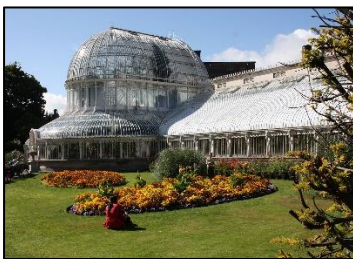
The Botanic Gardens

This is one of Belfast's oldest attractions and is one of the best markets in the UK. You can find food from around the world as well as local artwork, flowers, and handmade crafts [Art made from hand, not machine]. Furthermore, to keep you entertained, there are live bands performing on the weekends. So come on down and enjoy this vibrant [Full of energy and fun] atmosphere.