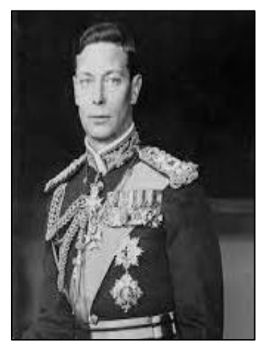
King Edward VIII [8th]