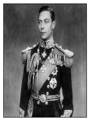
King George VI [6th]