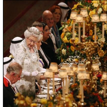
Our Queen being a hostess