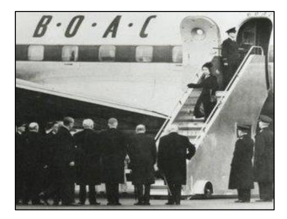
Landing in London as Queen Elizabeth 1952