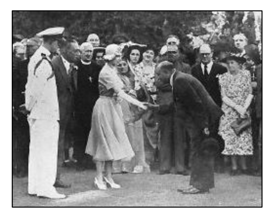
Kenya 1952 as Princess Elizabeth