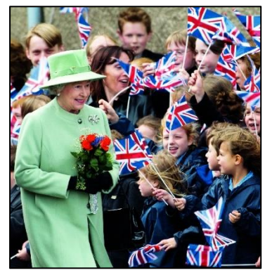
Travelling around the UK

She was the symbol of Britain and was our rock through thick and thin.